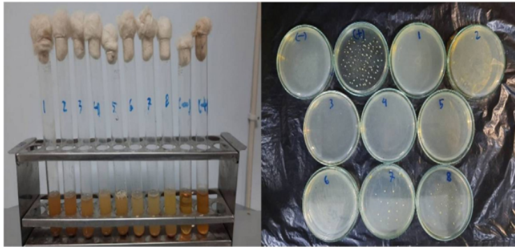
Figure 1: Growth inhibition of E. faecalis in Mueller-Hinton media induced Ambonese banana stem extract. Antimicrobial activity of each group at (-) negative control, (+) positive control, 1. concentration of 100%, 2. concentrations of 50%, 3. concentrations of 25%, 4. concentrations of 12.5%, 5. concentrations of 6.25%, 6. concentrations of 3.125%, 7. concentrations of 1.563%, 8. concentrations of 0.781%.

showed that at a concentration of 3.125% there was no growth of bacterial colonies. This shows that the administration of Ambonese banana stem extract with a concentration of 100-3.125% can inhibit bacterial growth, while the concentrations below that are 1.563% and 0.781% there is bacterial colonies growth of 13 colonies or 7.78% and 30 colonies or 17.9% (Table I).