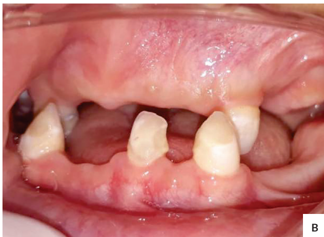
Figure 4. One month after the surgery, good wound healing (A) the left side: GIC restoration 63, 73, 71 remain intact; (B) the right side: GIC restoration 53, 83 remain intact.