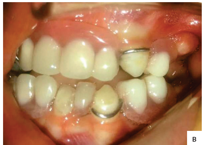
Figure 5. Insertion of the partial denture as space maintainer (A) the right side; (B) the left side.