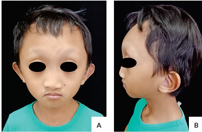
Figure 1. Facial characteristics (A) broad forehead, epicanthal fold, flat nasal bridge, periorbital fullness, malar flattening, smooth philtrum, thick lips vermilion, small chin; (B) large earlobes.