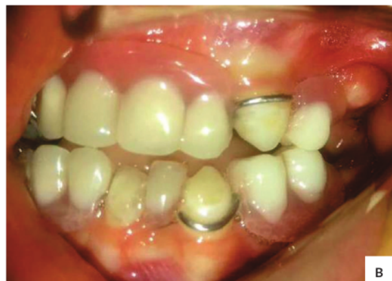
Figure 5. Insertion of the partial denture as space maintainer (A) the right side; (B) the left side.