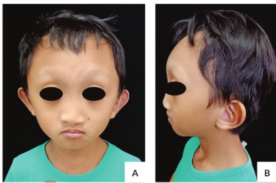
Figure 1. Facial characteristics (A) broad forehead, epicanthal fold, flat nasal bridge, periorbital fullness, malar flattening, smooth philtrum, thick lips, vermilion, small chin; (B) large earlobes.