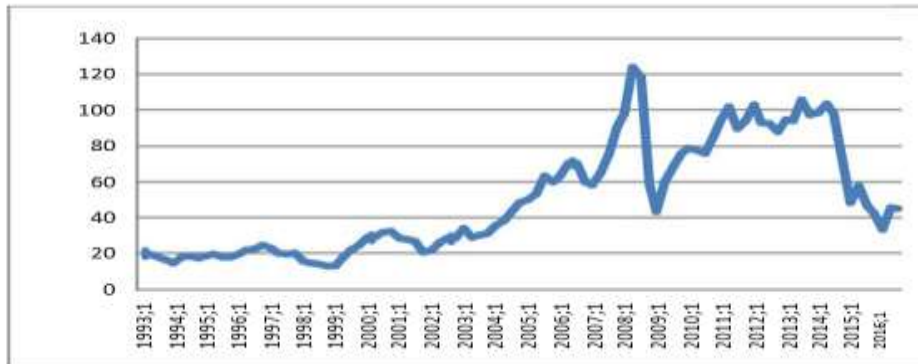
Figure 1. Fluctuations in World Oil Prices

Many studies show the shock of oil prices followed by weakening world economic growth. Cunado et al. (2015) concluded that a good monetary policy through exchange rate policy could reduce the negative impact of oil price shocks on macroeconomics in Asian economies.