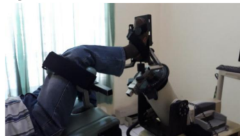
Figure 2. Isokinetic dynamometer position

The independent variable was the elastic taping procedure, and the dependent variable was DCR of ankle evtor-invertor. Data normality was confirmed using the Kolmogorov-Smirnov test. Results were evaluated for statistical significance ( p < 0.05 ) using paired t-test (parametric) or Wilcoxon Signed Ranks test (non-parametric). All subjects had signed the informed consent form and the study was approved by the ethics committee in Dr. Soetomo General Hospital.