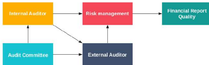
Figure 2. Synergy of Supervisory Mechanisms in Risk Management

The importance of risk management is closely related to the quality of financial reporting that will be submitted to the public. Cohen et al. (2017) shows that the strength of internal control can increase the effectiveness of ERM so that the quality of financial reports will be better. The audit committee through strategic aspects of ERM can produce more effective accounting estimates and disclosures related to risk considerations such as debt and inventory assessments. External auditors do not have a direct role in the company's strategic, operational and compliance objectives, but the presence of external auditors can improve the quality of financial reports which are important instruments for stakeholders.