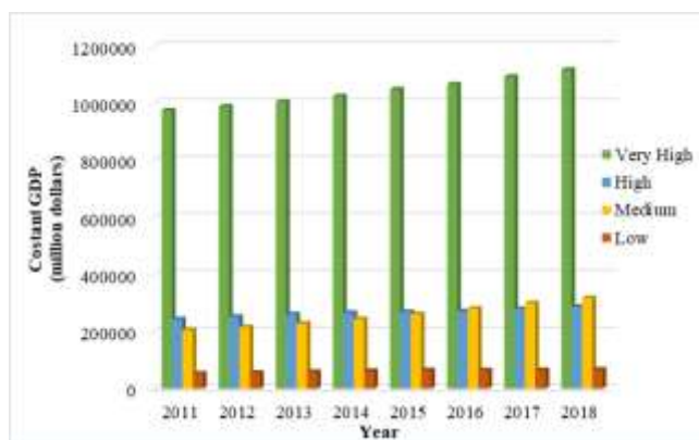
Figure 2. Economic Growth by HDI Category (in a million dollar)

These results are also in line with previous research, which showed a significant positive relationship between HDI and a country's economic growth and performance (Haller, 2014; Ulas and Keskin, 2017). In addition, the authors find that the countries with the highest HDI in the world are also the highest GDP producers in the world (Figure 2); this significant positive relationship is also explained by Ranis et al. (2000), who found that a higher HDI level will affect the economy through an increase in human capability, creativity, and productivity.