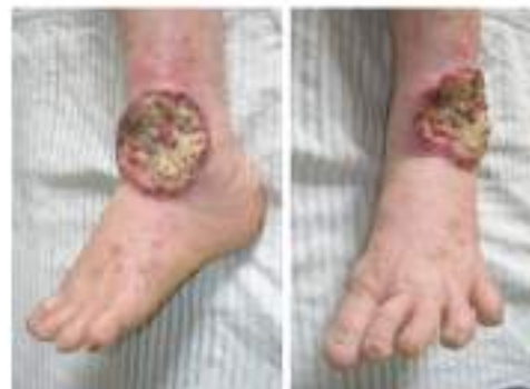
Figure 8. Clinical appearance at the first admission.

Marjolin's ulcer is a rare and aggressive cutaneous malignant transformation with an incidence of 0.1% to 2.5% after a long-term inflammatory or traumatic insult to the skin. All the patient on this report came with mass and ulcer as a chief complain. The first patient had history of burn when his age was 2 years old. The mass arise after 27 years later on the scar. It is suitable with theory that this kind of malignancy can occur after 20 - 40 years after trauma. 3