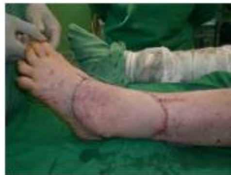
Figure 9. Immediate post-operative, defect was closed with anterolateral thigh free flap.