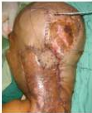
Figure 7. Immediate post-operative after the last surgery to closed the defect with split thickness skin graft.

Patient underwent wide excision surgery by surgical oncologist. The defect was closed with latissimus dorsi flap. Remain raw surface was closed with split thickness skin graft and the donor site was closed primarily. Evaluation on the ward, flap was viable but some split thickness skin graft didn't take. Patient underwent several surgical revision to close the defect with split thickness skin graft.