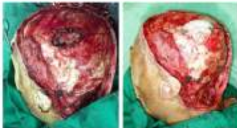
Figure 3. During the surgery there was infiltration to the calvaria, the defect was closed by neurosurgeon by acrylic and miniplate.