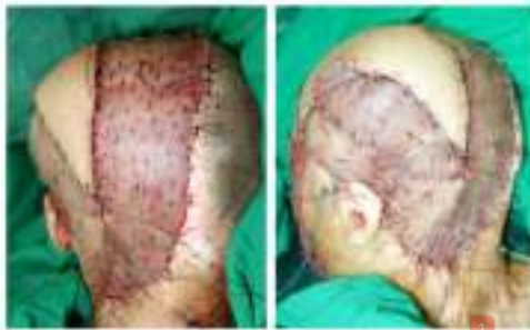
Figure 4. Immediate post-operative result. Defect was closed with latissimus dorsi free flap, remain raw surface was closed with split thickness skin graft.