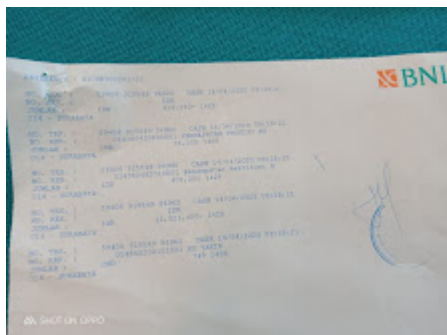
WhatsApp Image 2020-04-14 at 09.35.58.jpeg 71K