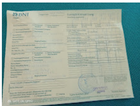
WhatsApp Image 2020-04-14 at 09.35.59.jpeg 123K