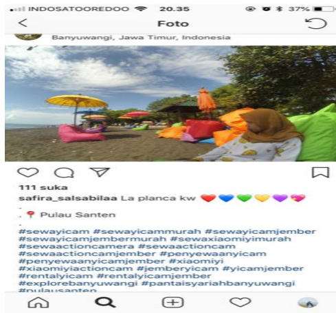
Figure 2: Sharia beach's visitor's posting.