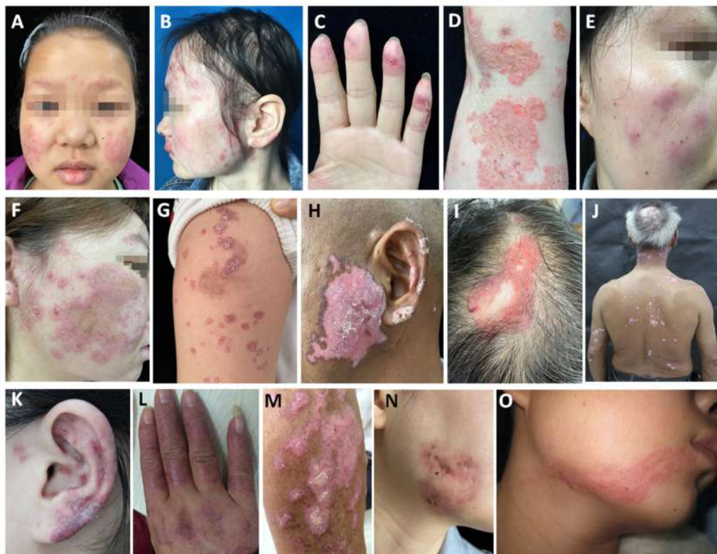
Fig. 2. Representative skin lesions of each subtype of CLE. (A–C) ACLE: typical manifestations of malar rash (“butterfly erythema”), diffuse alopecia and vasculitis of fingers, respectively. (D) BSLE: characterized by blisters and bullae on the erythema, which involve widespread area including the head, neck, trunk and limbs. (E) ICLE (also called LET): discrete, nonscaly, erythematous plaques or nodular skin lesions mainly involving sun-exposed areas (especially the face, the lateral and posterior neck, upper trunk and extensor surfaces of the arms). (F,G) SACLE: the annular subtype (F) and the papulosquamous or psoriasiform subtype (G), respectively, both of which mainly involves the sun-exposed area. (H,I) DLE: discoid erythematous plaques with firmly adherent scales/crusts, central atrophy and scarring, with hypopigmentation and hyperpigmentation, whose predilection sites include the face, auricle, and scalp, respectively. DLE of the scalp often leads to scarring alopecia. (J) DDLE: DLE lesions involving not only the head and neck, but also the trunk and upper limbs. (K,L) CHLE: chilblain-like edematous erythema or puffy nodules that can evolve into central erosion or ulceration sometimes, mainly involving cold-exposed acral areas (fingers, toes, heels, ears and nose). (M) VLE: DLE-like skin lesion(s) characterized by verrucous hyperplasia of the epidermis. (N) LEP: tender, indurated, erythematous plaques or deep nodules that can evolve into ulceration, disfiguring atrophy and scarring. (O) BLLE: a DLE-like, linear plaque of the skin along the Blaschko line. Abbreviations: CLE, cutaneous lupus erythematosus. ACLE, acute CLE. BSLE, bullous systemic lupus erythematosus. ICLE, intermittent CLE. LET, lupus erythematosus tumidus. SACLE, subacute CLE. DLE, discoid lupus erythematosus. DDLE, disseminated DLE. CHLE, chilblain lupus erythematosus. VLE, verrucous lupus erythematosus. LEP, lupus erythematosus profundus. BLLE, Blaschko linear lupus erythematosus.

anti-double strand DNA (dsDNA), anti-Sm and other anti-extractable nuclear antigen antibodies, and laboratory tests of complete blood count, urinalysis, urine protein to creatinine ratio, erythrocyte sedimentation rate and complements 3 and 4, are necessary. A newly identified epigenetic biomarker, IFI44L gene promoter demethylation in whole blood cell samples, has shown both a high sensitivity and a high specificity (both above 90%) for the diagnosis of SLE [13]. Detected by high-resolution melting-quantitative polymerase chain reaction (HRM-qPCR) assay, this IFI44L methylation biomarker can be a potential laboratory test to help distinguish SLE from DLE, with a sensitivity of 96.00%, a specificity of 72.55%, a positive predictive value of 77.42% and a negative predictive value of 94.87%, when 25% methylation is defined as the cutoff value [14].