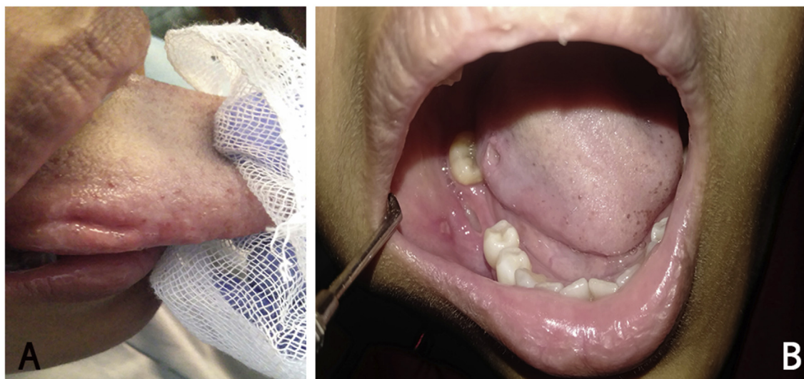
Figure 1: The oral ulcer in the lateral side of the tongue.

Extraoral examination, on palpation, showed that the submandibular lymph node was soft and palpably able to move. The intraoral examination revealed a solitary ulcer, 2 × 5 mm in size, the base of which was yellowish-white with a clear boundary, regular border, elevated induration, hard palpation around the lesion, and pain (Wong–Baker Scale score 2).