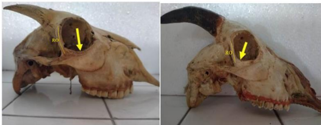
Fig (2): The lateral skull of Kacang goat. Left: Female goat. The circumference of aditus orbitae opening, is oval or elliptical, the zygomatic arch formed the ventral border of orbit as a curvature ridge and it lowest point placed in the middle of the margin ( arrow ), and (RO) the caudal orbit rim is curve in shape; Right: Male goat. The circumference of aditus orbitae opening is trapezoidal or rectangular, the zygomatic arch formed the margin almost horizontal along the ventral border, with the lowest point was located more caudally, below the sharp corner. (RO) the caudal orbit rim is straight incline.