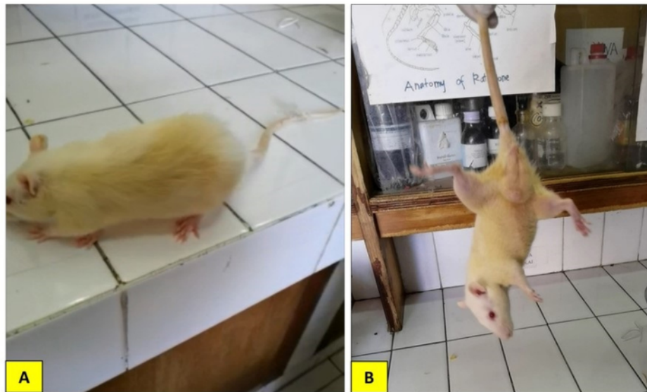
Fig. 2. Examination of mouse extremities muscle when (A) walking and (B) held at a height of 1 m.

The comparison of body weight among surviving mice is documented in Table 1. One mouse from the BACAS group that died had a body weight of 208 g,