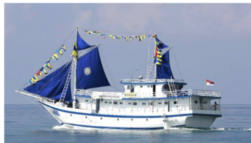
Figure 1. Ksatria Airlangga Floating Hospital (RST-KA)

happen. 7 It becomes a challenge how the protocol is implemented in the non-conventional hospital health facility such as Ksatria Airlangga Floating Hospital (RST-KA), which is a non-permanent mobile hospital in the form of the sailboat, that focused on the surgery service administration for regions with an inadequate health facility. In this series of case reports, four cases will be presented where 2 cases are the implementation of ERAS protocol and 2 cases are the conventional protocol on the social service concept in RST-KA.