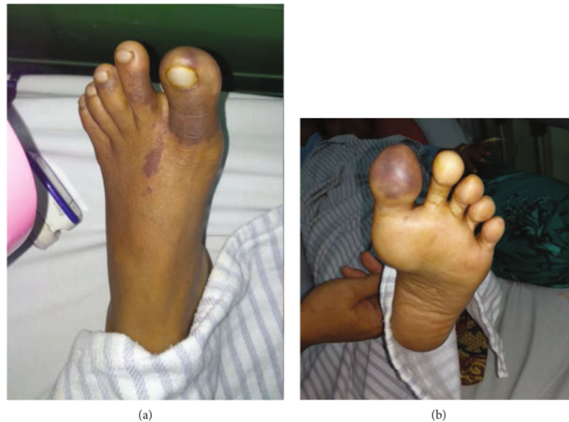
FIGURE 1: Image of dorsal (a) and ventral (b) views of the left foot in the initial settings with bluish pale area mostly distributed in digits I and II.

a JAK-2 mutase examination was performed based on the suspicion of ET.