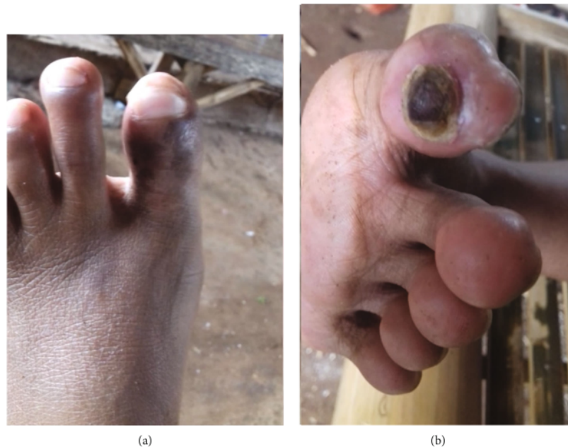
FIGURE 3: Image of dorsal (a) and ventral (b) views of the left foot in the six-month follow-up, with significant clearing of cyanotic area.

In cases of ALI associated with neurological deficits, immediate revascularization is mandatory; investigations and imaging should not delay patient revascularization interventions [13]. Various revascularization modalities can be applied, including percutaneous CDT, percutaneous mechanical thrombus extraction or thrombus aspiration (with or without thrombolytic therapy), and surgical thrombectomy, bypass, and/or arterial repair. The choice of a revascularization strategy will depend on the presence of a neurologic deficit, duration of ischemia, localization, comorbidity, type of blood vessel (artery or graft), and therapy-related risk and outcome. Because of favorable morbidity and mortality rates, endovascular therapy is often preferred by clinicians, especially in patients with severe comorbidities [1, 18].