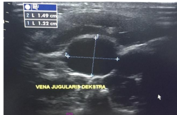
Figure 1. Short axis view shows the diameter of the right internal jugular vein

extending to the anterior. The swelling is pulsating. There was no enlargement of the lymph node. Her blood pressure is 170/100mmHg. She has bad compliance to come to the hospital regularly, and in three consecutive visits at the hospital, she has uncontrolled hypertension. The CT scan angiography revealed that dilatation of the right internal jugular vein was approximately 23mm as high as the right thyroid level.