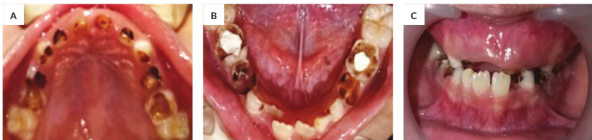
Figure 3. Pre-treatment clinical intraoral image of maxilla and mandible showed teeth 51, 61 gangrene radix with abscess.