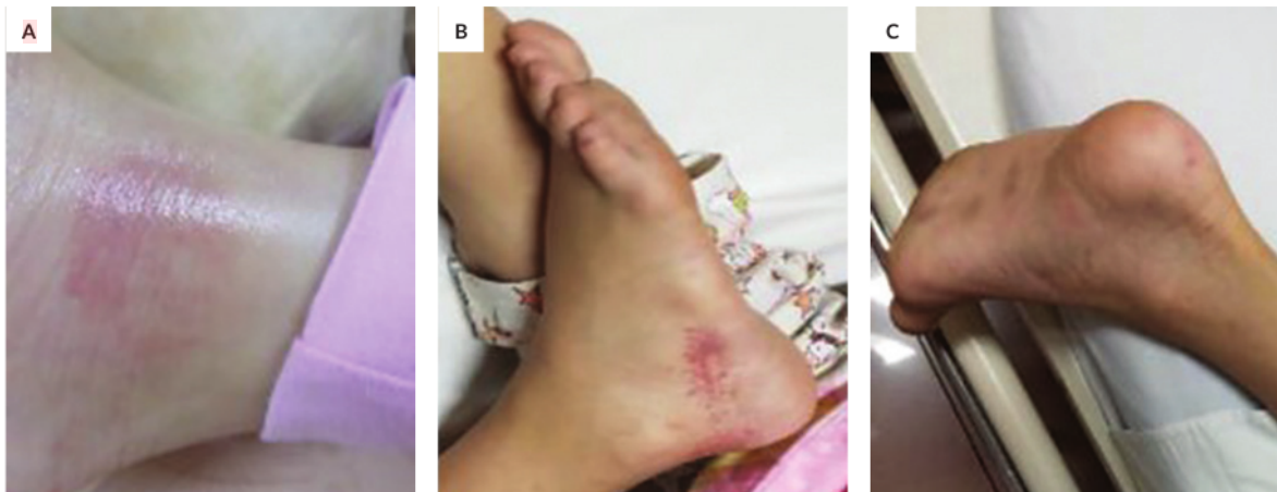
Figure 2. Reddish palpable purpura lesions at right and left lower extremities.