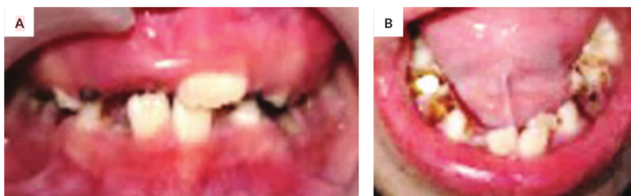
Figure 5. Intraoral condition after one month of treatment.

as systemic) complications. 9 The main biological concept in the treatment of dental abscess is based on the reduction of the causative agents, followed by the stimulation and the support of the regeneration of the damaged tissues. 10