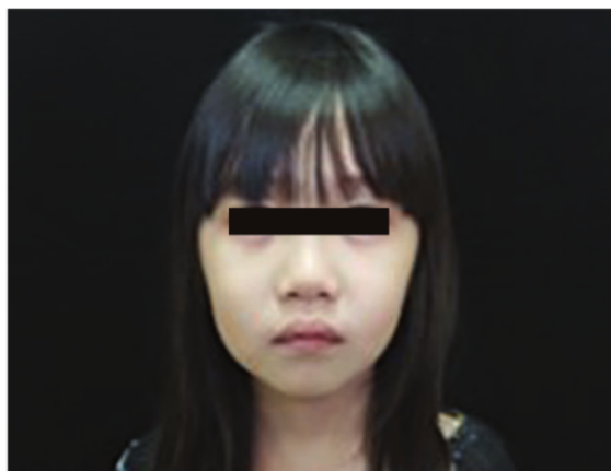
Figure 1. Extraoral photograph showed no facial abnormalities.

A 6-year-old girl, one of fraternal twins, was admitted to our pediatric department with fever, rashes on legs and arms and intermittent mild abdominal pain. There were multiple purpuric rashes on her extremities, abdomen and buttocks. Laboratory investigations revealed immunoglobulin A level of 289.6 mg/dL (Table 1). Other laboratory test results such as hemoglobin, leukocytes, total immunoglobulin E showed normal levels. There was no protein, glucose, bilirubin, urobilin, nitrite, and ketones in the urine (Table 2). The patient was diagnosed as HSP vasculitis according to EULAR criteria and treated with