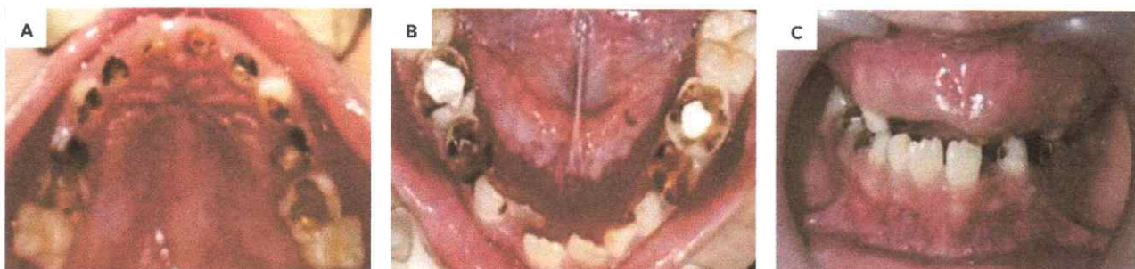
Figure 3. Pre-treatment clinical intraoral image of maxilla and mandible showed teeth 51, 61 gangrene radix with abscess.