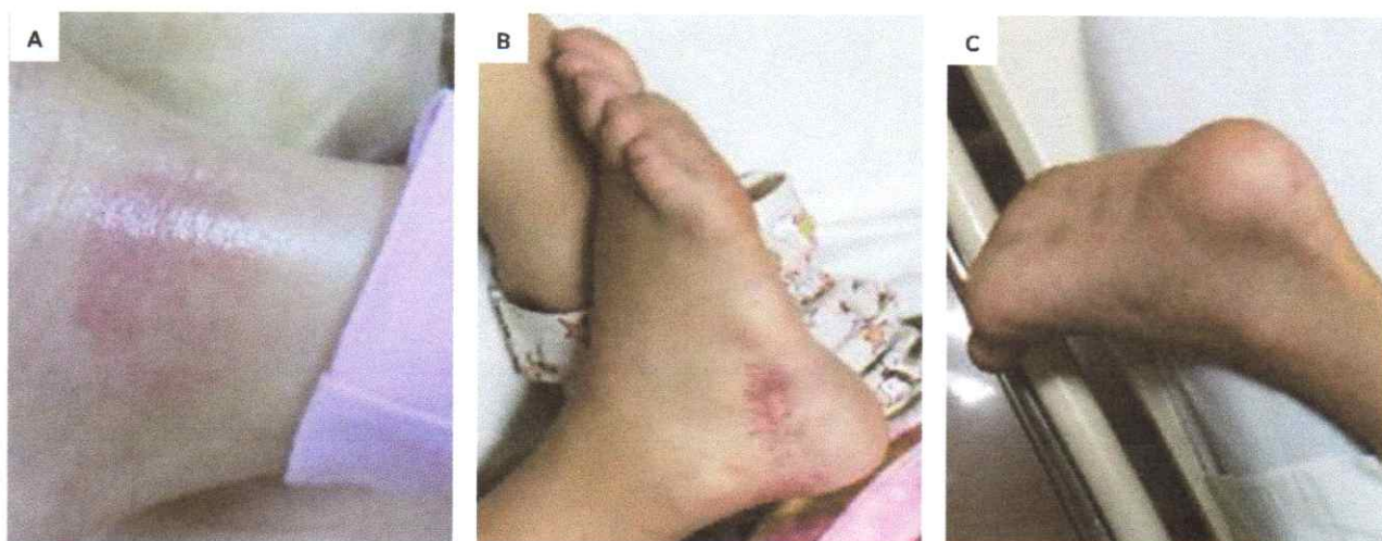
Figure 2. Reddish palpable purpura lesions at right and left lower extremities.