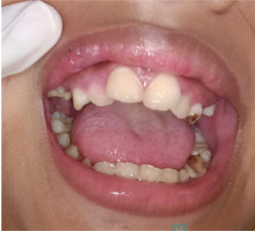
Figure 3. Day 7 post-operative. The surgical site healed well and the sutures were removed.

diagnosis are Lobular capillary haemangioma. One week postoperatively, there was no complaint from the patient. The surgical site healed well and the sutures were removed (Figure 3).