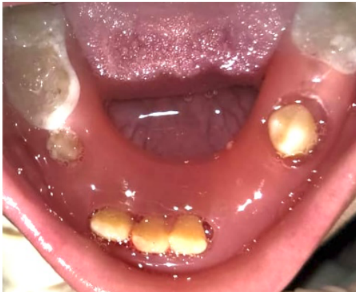
Figure 4. Modified closed cap splint was inserted in the mandible, with fixation using the GIC luting in the molar area.

parasymphysis fractures were shown to be healing. The bones and teeth have no swelling, redness, or movement. The condition of the anterior teeth were vital, there are no abnormalities during percussion and druk tests, and no mobility. Composite filling were performed on teeth #31 and #41. (Fig. 7). The apical tooth #32, #31, #41 has closed, and the radiolucent appearance on apical #32, #31, #41 seems faint in an OPG x-ray, indicating periodontal regeneration. Treatment results show good healing of soft tissue and hard tissue injury.