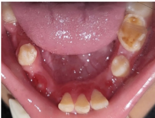
Figure 5. Day 34. Modified closed cap splint has removed. The symphysis/parasymphysis area substantially more stable, there is still redness of the gingiva due to the compression of the cap splint.