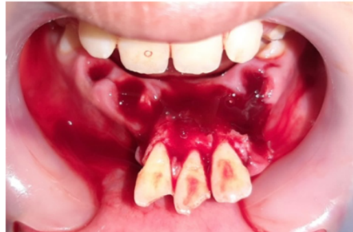
Figure 1. Intra-oral examination revealed symphysis/parasymphysis fractures in the dentoalveolar region #32, #31, #41 with avulsion on tooth #42, #73, #83.

the teeth's response to therapy in comparison to their initial status. The presence of radiolucent images on the apical teeth #32 #31 #41 indicates inflammation as a healing response, and a decrease in periodontal ligament's broadening. The patient was prescribed celecoxib as an anti-inflammatory and to accelerate the healing of the alveolar bone.