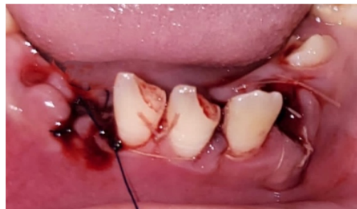
Figure 3. Suturing the front mandibular region.

A month after the splint cap was removed, a follow-up visit was conducted; there were no subjective complaints, and the symphysis/