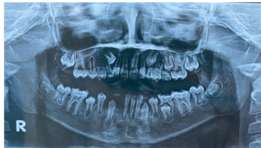
Figure 7. OPG after 1 month follow-up after the modified cap splint was removed. The apical area of tooth #32, #31, #41 has closed, and the apical tooth's radiolucent appearance has diminished.