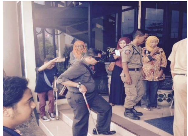
Figure 3. Members of DPRD were challenged to get into the building with their eyes closed, 2016.