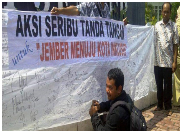
Figure 2. The 2013 petition signing

signing carried out by persons with disabilities in Jember Regency to fight for their rights.