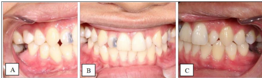
Figure 1 Pre-operative clinical photograph (A) Right lateral view, (B) Frontal view, (C) Left lateral view

Phase I treatment was carried out by scaling and root planing, and dental health education was carried out to the patient in order to always maintain a good oral hygiene. After evaluation, a phase II procedure in the form of a coronally advance flap was performed.