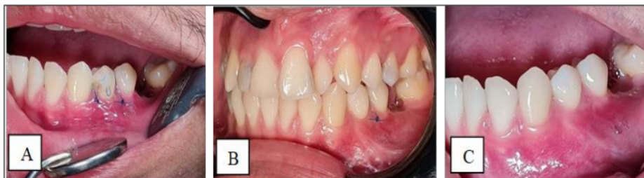
Figure 4 Control Post Coronally Advanced Flap: (A) One week post-operative (B) Two weeks post-operative, removal of sutures (C) Five weeks post-operative

The patient was given analgesic mefenamic acid 500 mg twice daily for three days, as well as betadine mouthwash twice daily after brushing his teeth. Patients were advised to practice good dental hygiene at all times and to stay away from spicy and acidic foods. The patient was then evaluated for 1 week and 2 weeks.