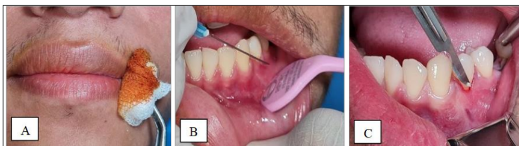
Figure 2 Coronally Advanced Flap Procedure: (A) Extra oral asepsis, (B) Infiltration local anesthesia on teeth 34 and 35, (C) Surcular incision

The patient was first given asepsis with povidone iodine before having a local anesthetic infiltrated with Septocaine on the mucobuccal fold of teeth 34 and 35. A sterile surgical draping is used to cover the patient and surrounding areas to maintain a sterile field during the surgery. A surcular incision was carried out with a 15c blade, on the facial side of teeth 33, 34, and 35 without involving any interdental tissue.