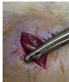
Figure 1. The compression of the sciatic nerve at a position 5 mm from the tip of the forceps.

The IgG levels were measured at 5 mm from the distal nerve lesion. The sciatic nerve tissue was homogenized in 600 \mu L PRO-PREP solution. Furthermore, cell lysis was induced by incubation for 20-30 minutes in a refrigerator at -20°C. Centrifugation was carried out at 13,000 rpm at 4°C for 5