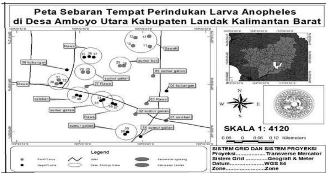
Figure 2. Map of Distribution of Breeding Places in Area with High Malaria Cases in North Amboyo Village, Ngabang Subdistrict, Landak Regency, 2018

mapping of breeding places distribution according to breeding places showed p=0.001 which meant that the clustering was significant. When there were cases of malaria near the cluster, there would be an increase in risk of malaria transmission in that cluster area.