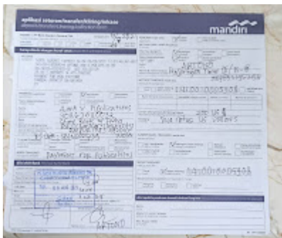
Proof of payment_ARTONO.jpeg 183K