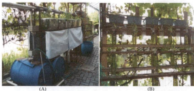
Figure 1. Aquaponic cultivation system with Nutrient Film Technique Model (A) and Floating Raft System (B)