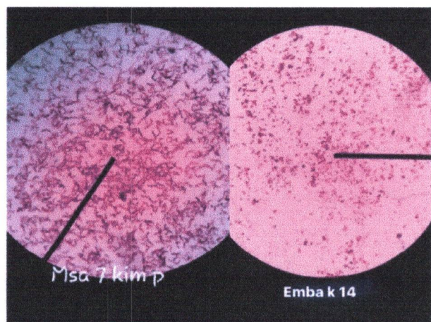
Fig 1. A. bacil Gram positive bacteria pn TSA/BA medium B. cocobacil Gram negative bacteria on EMBA medium