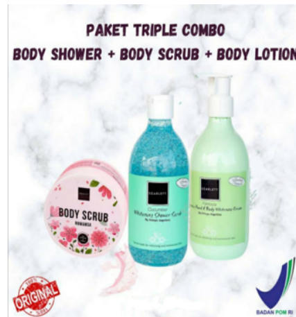
Figure 3. Instagram posts with Scarlett ads (2)

Lavender Water helps soothe troubled skin and acts as an anti-inflammatory.