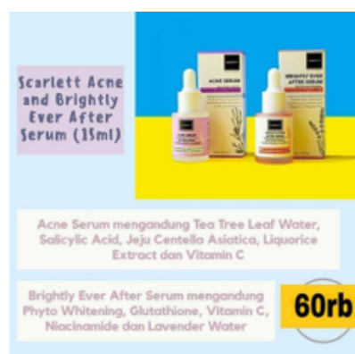
Figure 2. Instagram posts with Scarlett ads (1)

The five indicators that were coded were 1) advertising, 2) sales promotion, 3) public relations and publicity, 4) personal selling, and 5) direct marketing. The #scarlettlakilaki in Instagram posts are dominated by advertising signs.