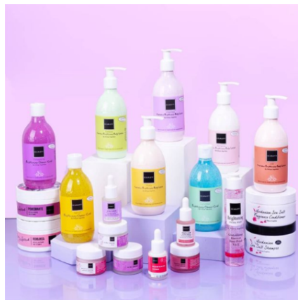
Figure 1. Scarlett product

Furthermore, brand image and trust have substantially impacted purchase intent (Sanny et al., 2020). Normative Influences and Attitudes for Applying Skincare are two factors that influence the behaviour of men consumers purchasing skincare goods in Suwon, South Korea. Beliefs in Product Aspects, Self-Image Aspects, and Aging Effects are among the elements that influence men's purchasing behaviour in Bandung, Indonesia (Ridwan et al., 2017); one of the skincare products is Scarlett.