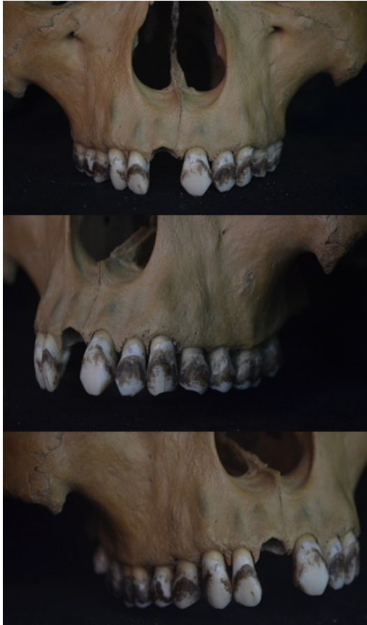
Figure 2 Dental modification of skull 160690 from frontal view.

eventhough it is not clearly visible (see Figure 2). The pattern of tooth filing on the incisors show that tooth filing had been done on the occlusal, mesial, distal and lingual surfaces. The evidence of tooth filing done on the lingual surfaces is also shown on the right and left canines (see Figure 3).