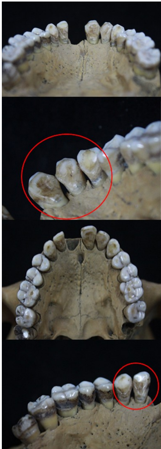
Figure 3 Dental modification of skull 160690 from lingual and occlusal view.

According to Koesbardiati et al. (6), there were various patterns of dental modifications found on the prehistoric skulls and one of those was found in Java (Binangun, Leran). Generally,