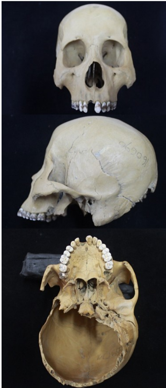
Figure 1 Skull of Balai Pemuda (160690) from frontal side, lateral and basilaris.

evidence itself with the context of the related population (11).