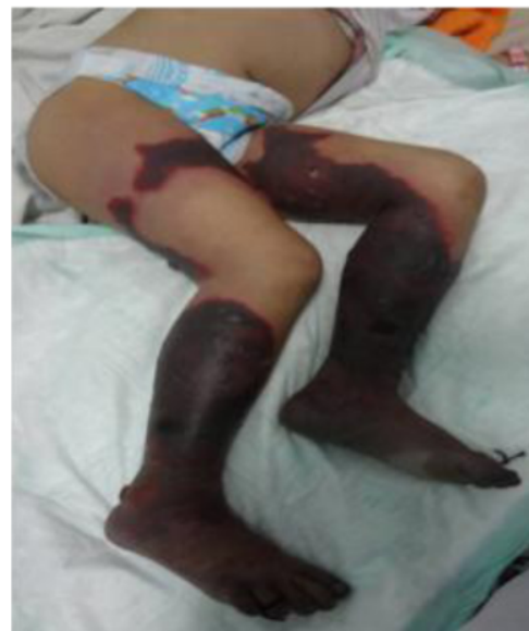
Fig. 2. Bilateral necrosis of the patient's lower extremities involving the pedal and tibial area with some areas of the thighs affected.

bone ends were exposed and dry. The patient was alert but looked malnourished. Unfortunately, the parents denied further treatment once again due to financial circumstances. Two months later, the patient was admitted to the surgical ward by the city council to receive prostheses. In spite of the cutaneous gangrene up to the thigh areas, there weren't any signs of any further propagation of the disease since her last admission. Physical examination showed autoamputation of both legs above the ankles without any signs of sepsis. Both knees were held in a slightly flexed position with adduction of both hips. Fig. 3 shows that both stumps had exposed bone with surrounding necrotic tissue. The lower extremities X-Ray results do not show any signs of destruction of the bones and their surrounding soft tissues as shown in Fig. 4. Debridement of necrotic bone and soft tissue and skin grafting was performed to cover the exposed tissue and bone ends. The child was subsequently fitted with patella tendon bearing prostheses. In the present day, 5 years after the operation, the patient is currently in a healthy condition without any additional complaints and is grateful that she is able