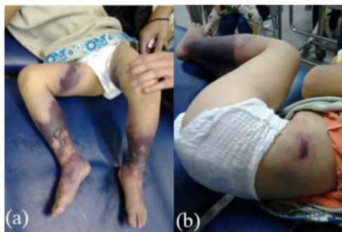
Fig. 1. (a), (b) The patient's lower extremities showing bluish and dark bruises with clear demarcation above the ankles.