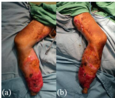
Fig. 3. Bilateral Autoamputation of the patient's lower extremities showing both tibial stumps with exposed bones surrounded by dry necrotic tissue.