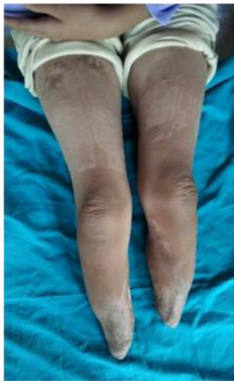
Fig. 5. The patient's Lower Extremities after debridement.