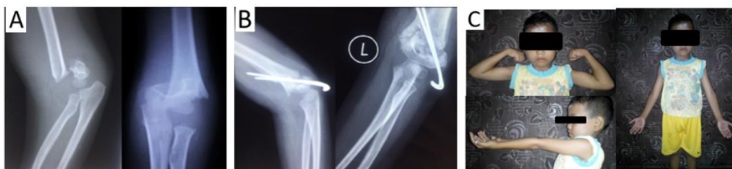
Figure 2. Clinical and Radiology Results of Lateral Fixation of Gartland type III SCHF (A. Pre-fixation plain image, B. Post-fixation plain image, C. Post-Surgical Clinical Image)