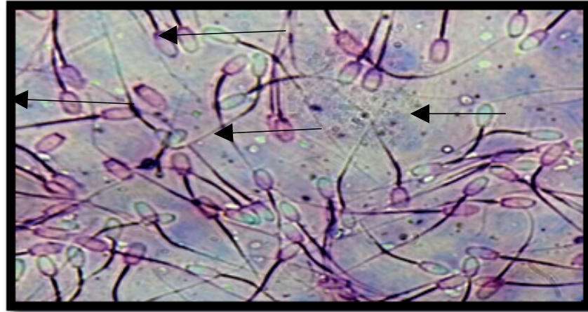
Figure 1: Test of Spermatozoa Viability (400X magnification). Live spermatozoa with white head (a) and dead spermatozoa with red head (b).

sperm motility (+++), and individual motility 80%. Based on the results of macroscopic and microscopic fresh sperm fat tailed sheep are still worthy of further research.