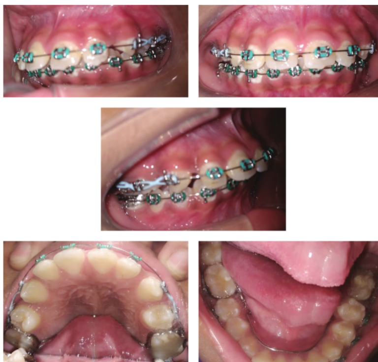
Figure 4. Intraoral (still in progress).

for a while by carrying him around and showing him things. After which he will calm down and sit in the dental chair and be cooperative again. After the first session and continuous interventions, the ADHD symptoms seem to get better evidenced by the patient being more cooperative, quiet and the parents expressed more understanding about the treatment.