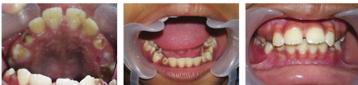
Figure 2. Intraoral profile of the patient.