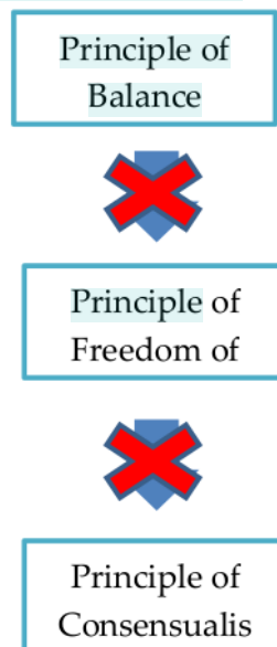
Digaram 2. A Construction of the Absence of the Principle of Balance in an Agreement

is the principle of freedom of contract. However, it must be understood that above the principle of freedom of contract there is a principle of balance that must exist in agreement. Without the principle of balance, there is undoubtedly no substantive freedom of contract and indeed no principle of consensualism. The existence of a misconception that considers the principle of freedom of contract so that it is deemed to create a consensualism can be called ex falso quo libet (misconceptions lead to wrong conclusions). 38 To facilitate understanding the construction of legal consequences regarding the absence of the principle of balance in the agreement is as described in the flowchart below.