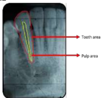
Fig.1: An illustration of the selection of the pulp and tooth area