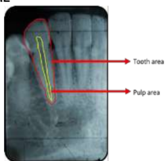
Fig.1: An illustration of the selection of the pulp and tooth area