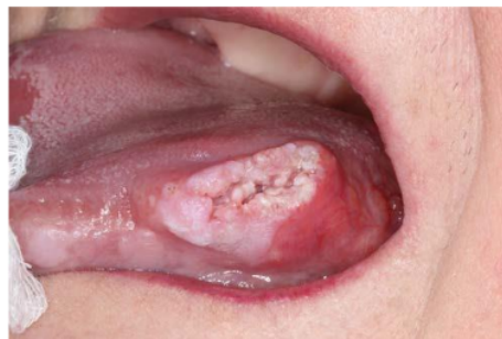
Figure 1. An exophytic form with a central depression and widespread keratosis on the left lateral side of the tongue characterises a well-differentiated squamous cell carcinoma lesion. 18

The p53 gene is a tumour suppressor gene. Cell-cycle arrest, cell ageing and DNA repair are all controlled by the p53 gene. Deoxyribonucleic acid damage will activate ataxia-telangiectasia mutated, which phosphorylates and releases p53 from mouse double minute 2 homolog (MDM2) binding, causing the amount of p53 proteins to increase. Increased p53 proteins will activate the p21 gene, which works as a cyclin-dependent kinase inhibitor to stop the cell cycle in damaged cells. After cell cycle arrest, damaged