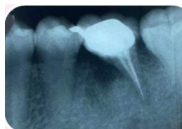
Figure 7. Radiograph post treatment.