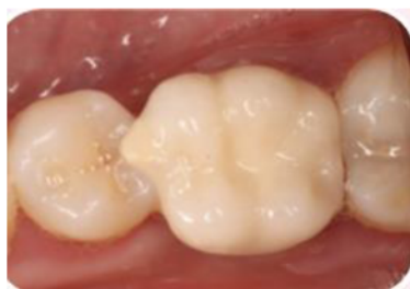
Figure 6. Final Restoration.