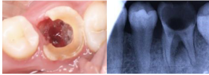
Figure 1. Intraoral and Radiograph before treatment.