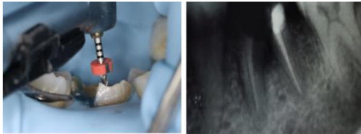
Figure 2. Shaping, cleaning and obturation.