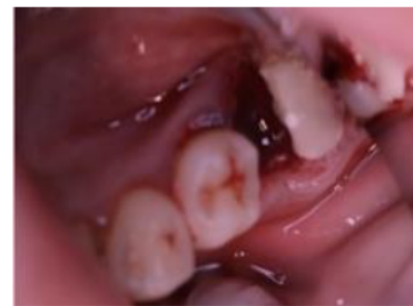
Figure 4. Hemisection.