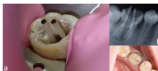
Figure 4. a. fiber post trial clinical view b. fiber post periapical radiograph placement confirmation. c. 36 after fiber post cementation and build up.