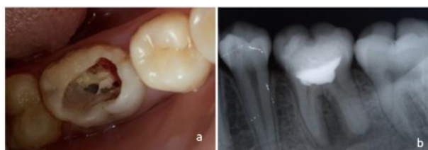
Figure 1. a.clinical view b. periapical radiograph on 36.

The root canal preparation is done using Protaper Next to X2 files on all root canals, after h a try-in photo