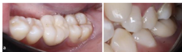
Figure 5. a. occlusal view after crown sementation b. crown in relation in occlusion.