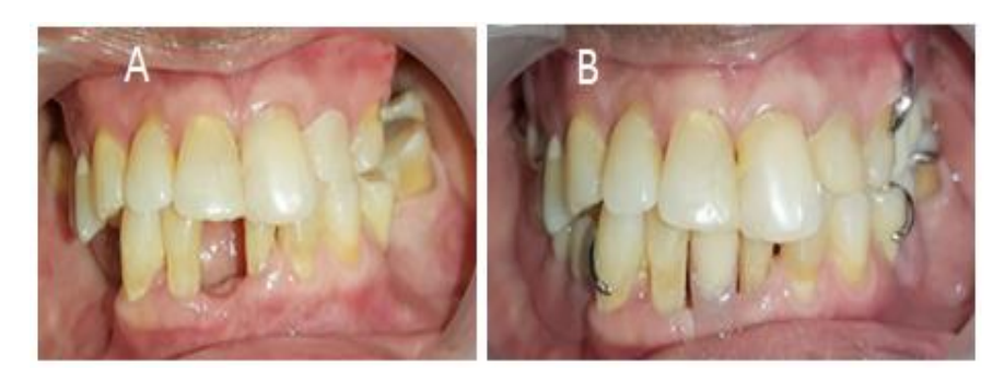
Figure 4: Before and after treatment

Subsequent laboratory work is making teeth contours acrylic packing, polishing, and inserting dentures on patients. During insertion, pay attention to the retention and stability of denture, esthetics, and patient comfort when using denture, phonetics, occlusion, and patient articulation. The patient was instructed to wear the denture for 24 hours, and the denture should not be used for eating and control the next day. The first and second control a week later, the patient had no complaints, the denture was used to chew food as usual, and the patient was delighted (Figure 4).