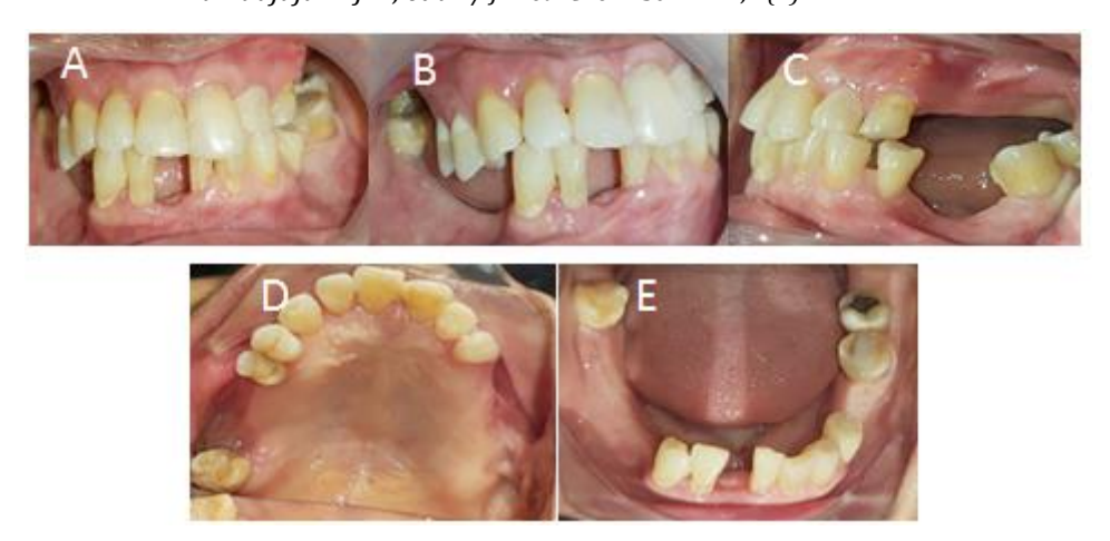
Figure 1: Intra Oral. In front (A), Right (B), Left (C), Maxilo occlusal (D), and Mandible occlusal (E)

Based on Figure 1 above, the oral hygiene seemed medium and there was a patch on the teeth number 11, 15, 14, 18, 21, 23, 37, 38, and 48; caries on teeth 11 and 21; abfraction on teeth 23 and 34; and lost teeth 16, 17, 24, 25, 26, 27, 28, 35, 36, 41, 44, 45, 46, and 47. On the radiographic examination (Figure 2), there were radiopaque images of dental crowns and root canals 18, impressions of the root canal and dental fillings, radiopaque images of dental crowns on 15, 14, 22, 23, 37, 38, 48, the impression of dental fillings, radiolucent appearance of the crown of teeth 11, 21 impressions of dental caries, missing teeth 17, 16, 24, 25, 26, 27, 28, 36, 35, 44, 45, 46, and 47, and bone loss in region 1, 2, 3, and 4.