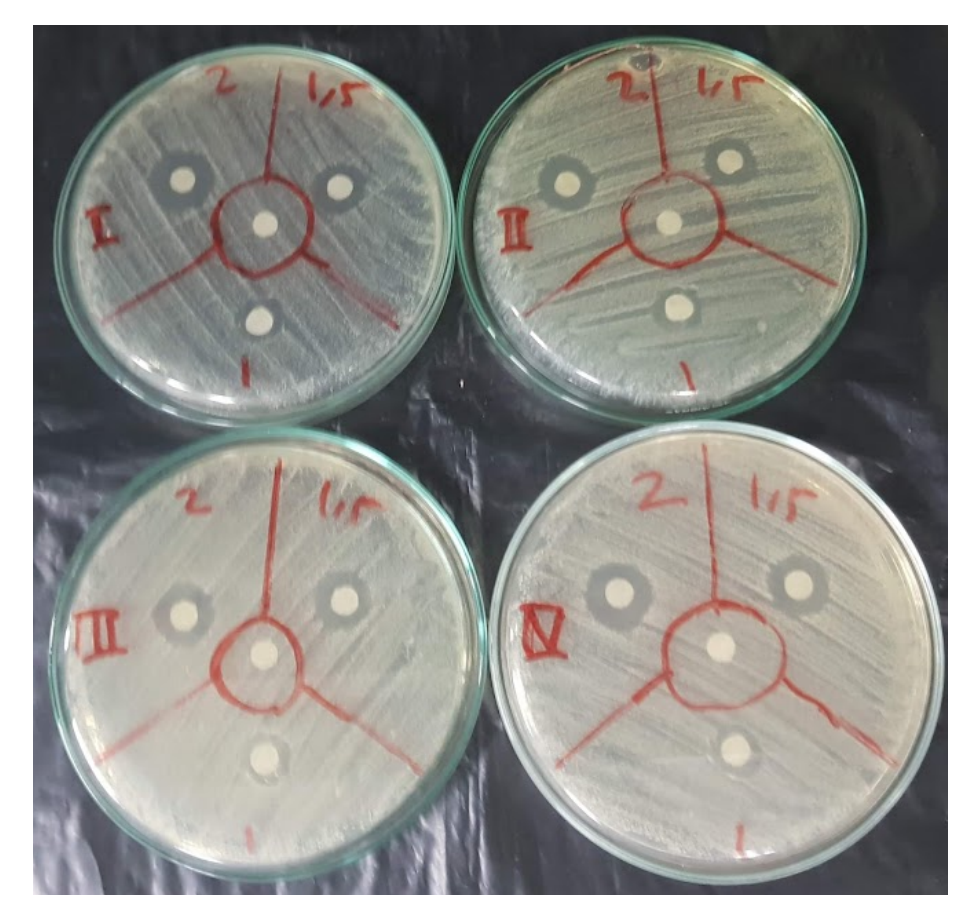
Figure 1: The antibacterial effect of Chitosan Solution against Streptococcus mutans

Figure 1 shows that chitosan solution inhibits the growth of Streptococcus mutans bacteria. Where the antibacterial potential at 2% concentration is greater than other concentrations. The measurement results of the inhibition zone in each treatment group are as follows.