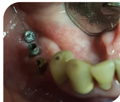
Fig 6 One abutment was changed with anatomic abutment.

Three weeks upon the second operation, the dental implants were in a state of health and functioning in their intended purpose, the mucosa had a full recovery and the impression was done. One of the abutments was changed with anatomic abutment due to realignment of prosthesis position.