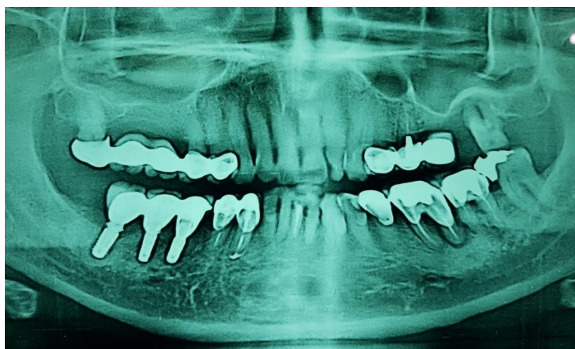
Fig 8 Panoramic radiograph 6 months after treatment.

When placing dental implants, it should be known that even a series of metabolic changes occur around the implant, leading to the formation of bone closely linked to the implant surface (osseointegration). Implants can be osseointegrated while the bone and surrounding soft tissues heals and, if chemotherapy is to be given, implants can normally have osseointegrated before the chemotherapy. 4