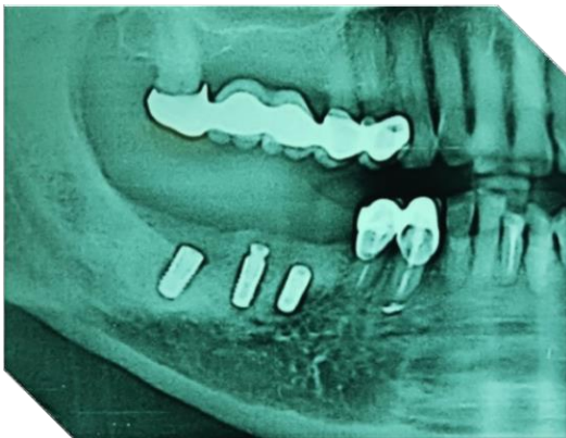
Fig 4 Radiograph examination 1 year after insertion.

Clinically, the implants submerged in soft tissue, with no apparent exudate or bleeding. The