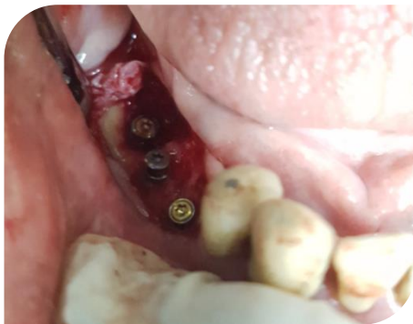
Fig 2 Three bone level dental implant fixtures were inserted.