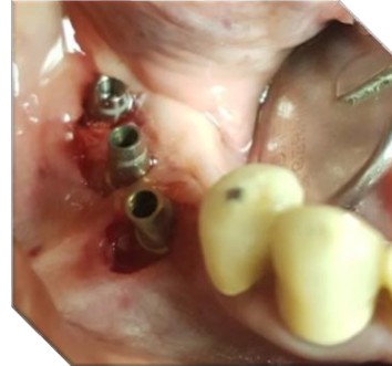
Fig 5 Abutment at second procedures.

At the time second procedures were performed, the dental implants had provided support for the abutments.