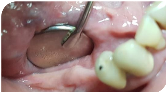
Fig 3 Clinical intra oral examination 1 year after insertion