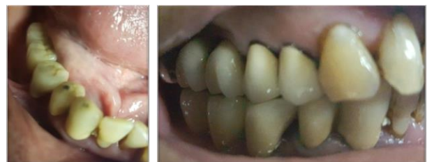
Fig 7 Three crowns porcelain fused to metal.

Finally, three crowns porcelain fused to metal were used as final restorations and harmonized occlusion was achieved. Panoramic view was taken 6 months after the treatment had fully been accomplished.