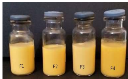
Figure 1: NLC-CoQ10-PO formula.