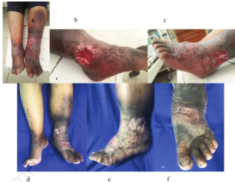
Figure 1. a, b, c Tumor with verrucous surface 10 cm in diameter, hard with multiple uneven edge ulcer 5 cm in diameter and hyperpigmentation macule unsharply marginated around at regio pedis sinistra; d, e, f After treatment with Itraconazole 2 x 200 mg for 12 weeks. Verrucous surface has been decreased and wound healing showed a good progress.

ed in the tissue at a higher level than in the plasma. The bioavailability of the drug is increased if it is taken with a fatty meal, but can be decreased in patients taking drugs that impair gastric acidity, such as histamine-2 blockers and antacids. 6-9 There is no difference treatment of cutaneous aspergillosis in an immunocompetence and immunocompromised patients. In this case, there was a good clinical response of Itrakonazole treatment.