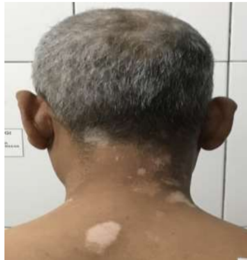
Figure 3 Vitiligo with leukotrichia before NB-UVB therapy.

Leukotrichia is known as poor indicator for treatment response in vitiligo, but this study showed that leukotrichia may not contribute to the lack of response upon medical treatment, and evaluation of therapy by looking at the amount of melanocytes that can be seen with S100 protein immunohistochemistry will become