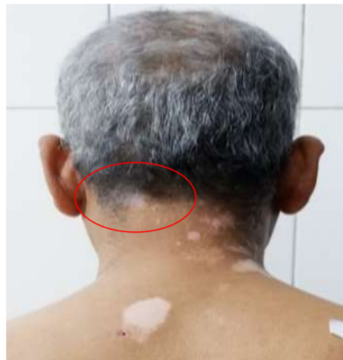
Figure 4 Vitiligo with leukotrichia after NB-UVB therapy.

more objective and accurate, but still need a further research.