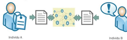
Figure 2. Illustration of data transaction process using blockchain. 48

Each data that appears and will be recorded is referred to as a block. Each of these blocks forms a series so that it is called a blockchain or block chain, and the block will prevent data misappropriation. Because every change of the data already stored in the blockchain will affect the blocks that follow and, of course, will be immediately realized by the system so that it will not be easily changed. The advantages of blockchain are: 49