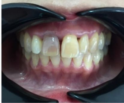
Figure 3. Preoperative photograph of discolored tooth

On the third visit, a subjective examination was conducted, it was no complaints from the patient. Objective examination showed that tooth discoloration from C3 to A3 (Vitapan Classical). Two weeks later, the tooth was restored by composite materials which in accordance with the tooth colour.