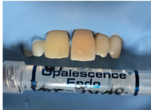
Figure 6. Internal Bleaching Agent