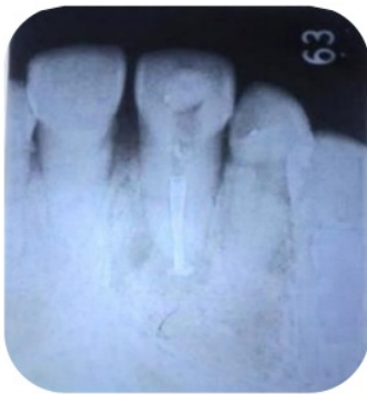
Figure 8. Post operative radiograph

On the third visit, a subjective examination was conducted, it was no complaints from the patient. Objective examination showed that tooth discoloration from C3 to A3 (Vitapan Classical). Two weeks later, the deposition was carried out by composite materials which in accordance with the tooth colour.