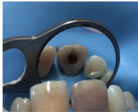
Figure 5. Photograph of the tooth after placing hydrogen peroxide intra coronally