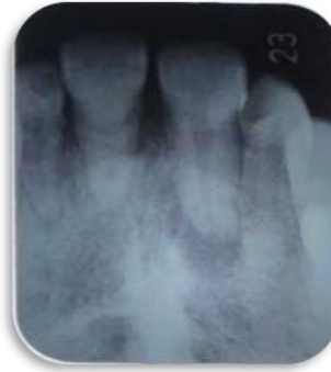
Figure 4. Preoperative radiograph