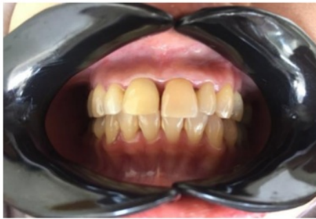
Figure 7. Post Operative Photograph