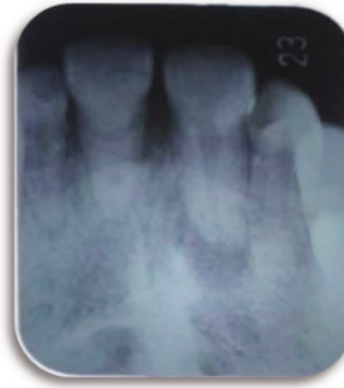
Figure 4. Preoperative radiograph