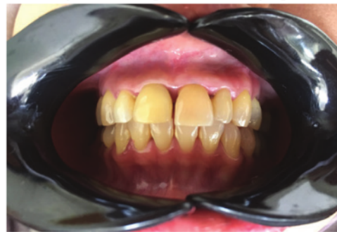
Figure 5. Post Operative Photograph