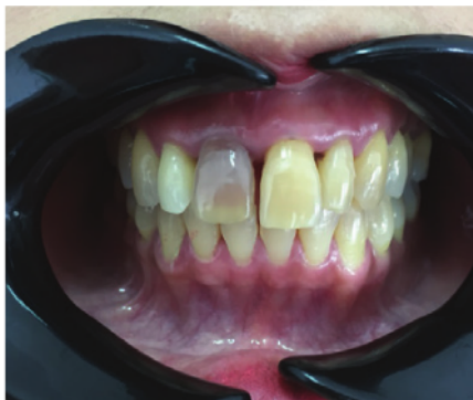
Figure 3. Preoperative photograph of discolored tooth