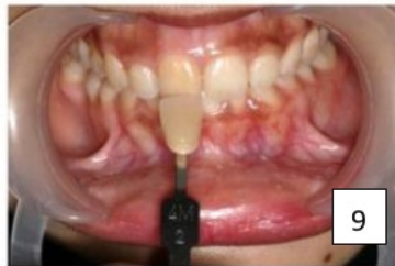
Figure 9. Shade guide determination

into the pulp chamber and light cured temporary fillings were placed (Figure 12). Patient was asked to control in 3 days if the discoloured tooth had similar colour with adjacent tooth.