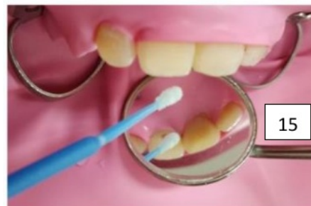
Figure 15. Bonding application;