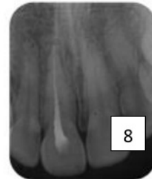
Figure 8. Obturation radiographically confirmed

At the 1-week follow up, the extraoral and intraoral revealed no symptoms or signs. The color of the tooth (Figure 9) was measured under regular daylight with a Vita 3D shade guide (4M2). The tooth was isolated using a rubber dam, and removed the temporary fillings. Then, reduction 2mm of gutta percha in above the cemento-enamel junction (CEJ) (Figure 10), and Glass Ionomer Cement as a cervical barrier was applied which used ski slope and bobsled tunnel appearance design, confirmed radiographically (Figure 11). Bleaching agents (35% Hydrogen Peroxide) applied