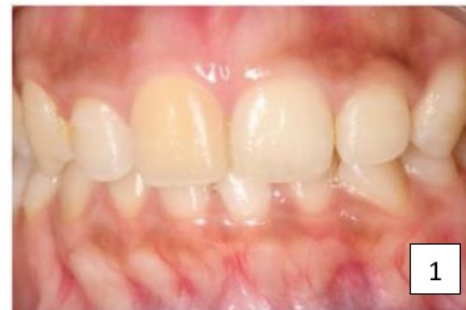
Figure 1 : Discolored maxillary right central incisor tooth

From Clinical and radiographic, A diagnosis maxillary right central incisor was non vital tooth (pulp necrose), based on a vitality test using an electric pulp tester.