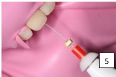
Figure 5. Irrigation activation;