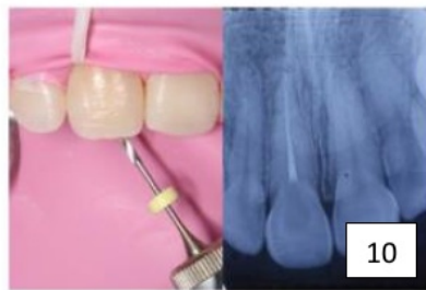
Figure 10. Gutta percha removal