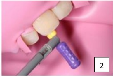
Figure 2. Working Length determination

minute. Respiratory frequency was 16 breaths per minute. Root canal treatment was performed on tooth 11. First, the teeth were isolated using rubber dam, then access cavity preparation was performed. The canal were negotiated to the apex using #10 K-files. An apex locator was used to assess the working length (Figure 2) and it was radiographically confirmed (Figure 3). An apical glide path was established using a Proglider file (Dentsply).