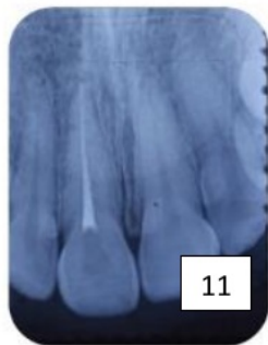
Figure 11. Cervical barrier placement;