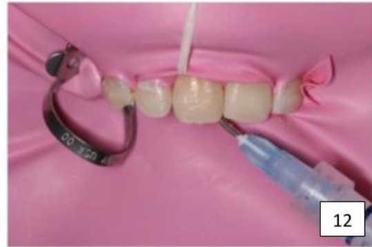
Figure 12. Application of bleaching agent

At the 3-days follow up, the discoloured tooth had similar colour to the adjacent tooth, checked with Vita shade guide 2M2 (Figure 13). The tooth was isolated using rubberdam, and temporary fillings were removed. The saline was rinsed and dried in the pulp chamber, calcium hydroxide was added, and placed in the dental chamber for a week until final restoration.