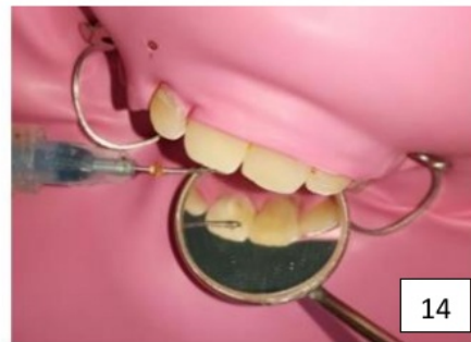
Figure 14. Etch application;

inflammation (Figure 19). Patient has satisfied with the result.