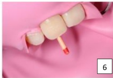
Figure 6. Trial gutta point