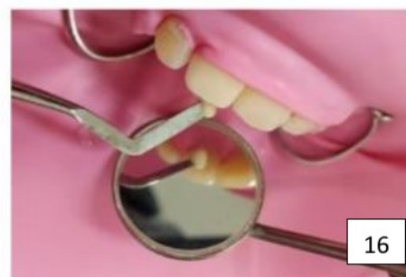
Figure 16. Composite application;