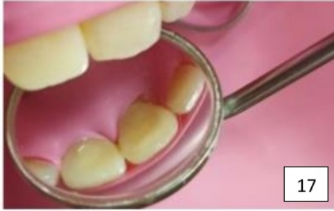
Figure 17. Permanent restoration