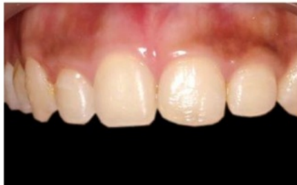
Figure 18. Post Operative;