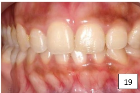
Figure 19. 3 month after permanent restoration