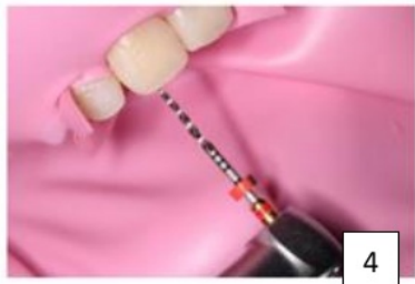
Figure 4. Biomechanical preparation