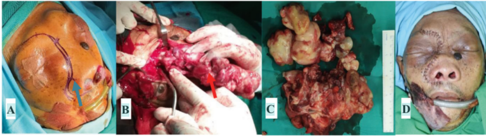
Fig. 3. Medial maxillectomy surgery with an extended Killian right lateral rhinotomy approach. (a) Killian incision groove (blue arrow); (b) tumour was well-defined, with a chewy solid consistency, easy to bleed (red arrow); (c) The tumour's size was 12.5 × 8.7 × 5.5 cm, weighed 258 g; (d) surgical wound closure. (For interpretation of the references to colour in this figure legend, the reader is referred to the web version of this article.)

recurrence due to residual tumour as by Fagan, et al. reported 37.5 % recurrence NA after surgical excision [8].